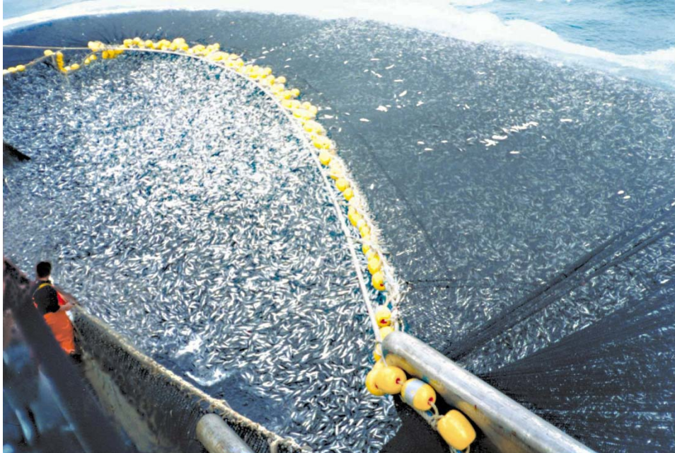
Chilean jack mackerel caught in a purse seine net

Chilean jack mackerel is caught mainly for processing into fishmeal. Studies in other species have shown that fish caught in purse seines experience high levels of stress.