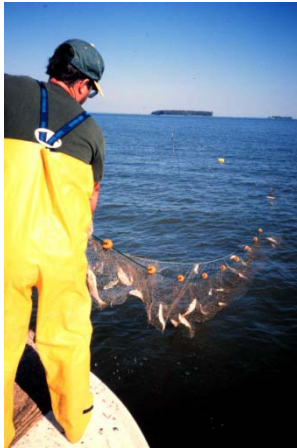
Gill net catch being brought in

In some gill net fisheries, fish can remain snared in nets for many hours, or even days.