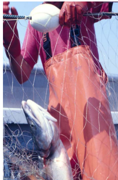
A salmon caught in a gill net

Further injury to skin and scales may be caused when the net is hauled in over roller guides and in removal from the net. Loosely attached fish may be gaffed (i.e. their bodies spiked with a hand held hook) to bring them on board. Snared fish are then pulled out by hand or removed by shaking the net.